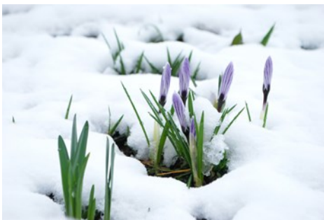
Spring is Coming!!!

Please drive slowly and cautiously in the parking lot. It can get quite congested and we'd like everyone to be on alert to children in and around the vehicles. Thank You!